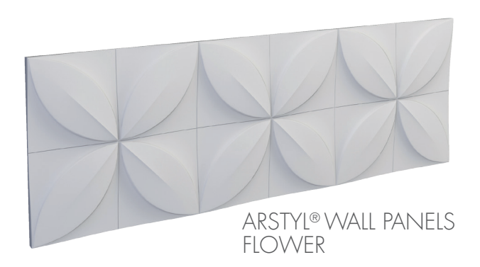
At 1135 mm \times 30 mm, the FLOWER design variant is the same size as the other panels of the ARSTYL ^{\circ} WALL PANELS collection from NMC.

Creative, design-oriented, effective: the ARSTYL® WALL PANELS are setting new standards, with wowing effects. Their high quality three dimensional surface has convinced interior architects, decorators and designers.