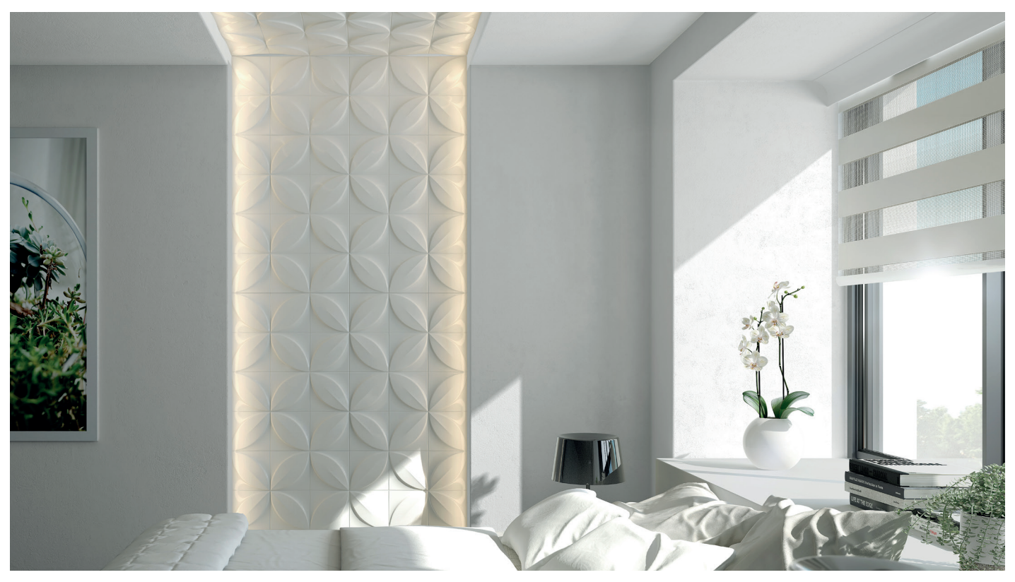
Targeted interior highlights can be created with ARSTYL® WALL PANELS FLOWER from NMC. The three dimensional panel is particularly suitable for a vibrant yet fine play of light and shadows.

NMC has expanded the ARSTYL® WALL PANELS collection with the three-dimensional model FLOWER, which will be presented for the first time in September 2017 at the "Maison & Objet" fair in Paris. This means that there are now nine attractive design variants of the popular wall panels.